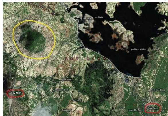
Satellite view of our AO today. Nui Ba Den circled in yellow, Tay Ninh and Dau Tieng in red

They say you can never go back, and in the case of our little corner of Viet Nam, that appears to be very true. Our former Area of Operations has changed dramatically. The Crescent and War Zone C are now mostly submerged under a reservoir made by damming up the Saigon River. And Nui Ba Den, the Black Virgin mountain, once the scene of vicious battles for the peak, is now a tourist attraction, with an aerial tram to take you to the top instead of helicopters. It kind of makes you think.