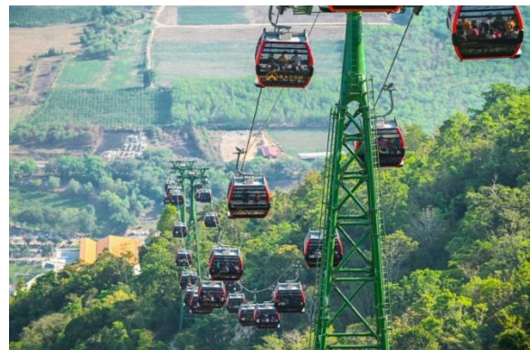
Nui Ba Den Tram