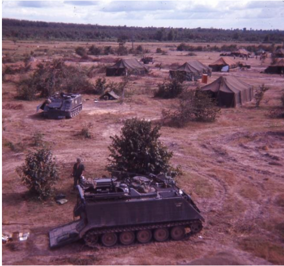
The New Camp Dau Tieng