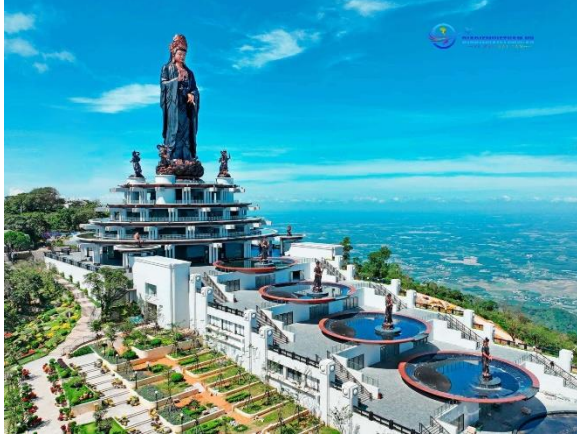
Núi Bà Đen Peak