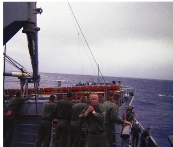
On the boat to Viet Nam