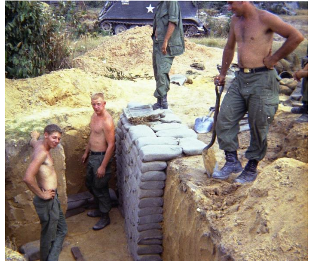
Dau Tieng bunker building