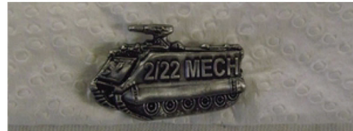
Triple Deuce Track Pin $5.00 + $3.00 shipping