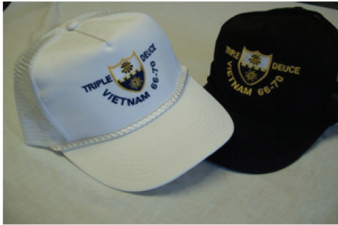
Summer Hat $19.00. Available in white and black. Five panel hat One size fits all