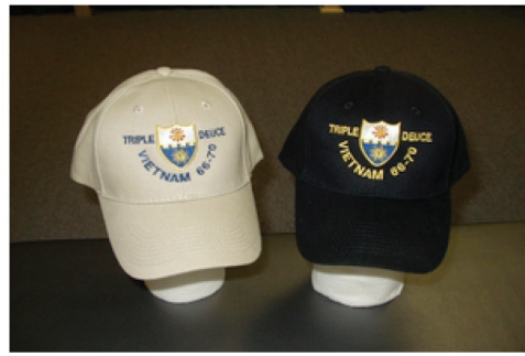
Six Panel Hat , $19.00 Available in khaki and black