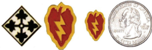
Small Division Pins. $5.00 each + $3.00 shipping Large 25th Infantry. $7.00 each + $3.00 shipping