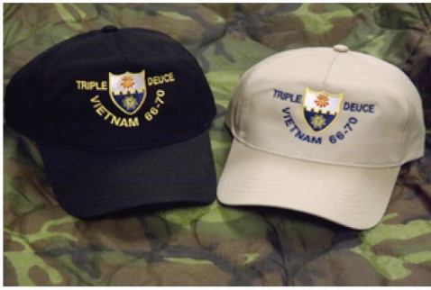
Five panel hat , $19.00 Available in khaki and black.