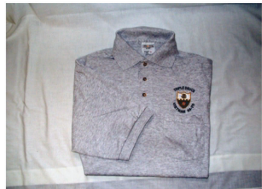
Grey Polo shirt with pocket. $29.00 ea. sizes small to XL $33.00 ea. sizes 2XL and 3XL Special colors add $3.00