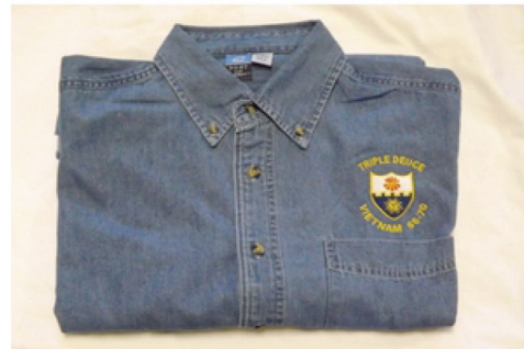
Dark denim long sleeve shirt with pocket. $37.00 sizes small to XL $39.00 sizes 2XL and 3XL Special colors add $5.00