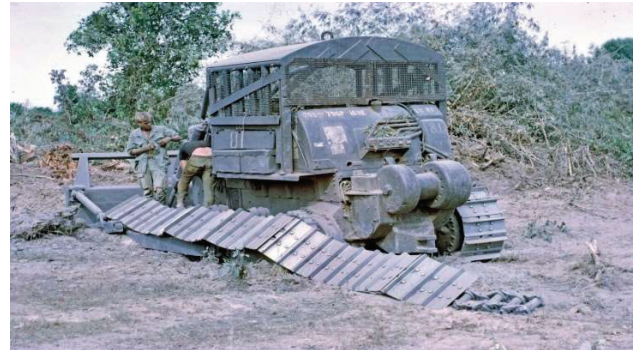
Anti-Tank Mine-Damaged Rome Plow

Rome plow drove over it. The drivers only seemed to worry about two things: bees and red ants.