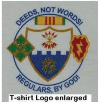
T-shirt Logo enlarged