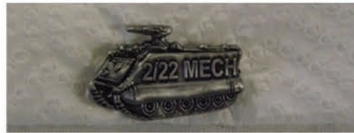
Triple Deuce Track Pin $5.00 + $3.00 shipping