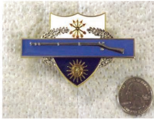
22nd CIB/DUI pin. $12.00 + $3.00 shipping