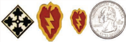
Small Division Pins. $7.00 each + $3.00 shipping Large 25th Infantry. $9.00 each + $3.00 shipping