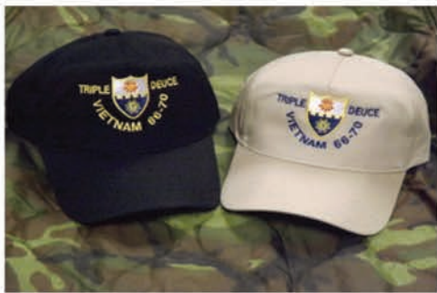
Five panel hat , $18.00 Available in khaki and black.