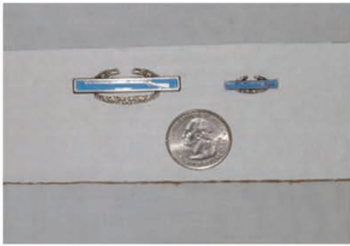
Midi CIB. $7.00 + $3.00 Shipping Mini CIB. $5.00 + $3.00 Shipping