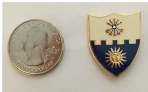
22nd Infantry Crest Pin. $7.00 + $3.00 shipping

1 Coin $ 10 Ea. shipping included 5 Coins $9 ea. + $3.00 shipping 10 Coins $ 8 ea. + $4.00 shipping 15 Coins $ 7 ea. + $7.00 shipping 20 Coins $ 5 ea. + $7.00 shipping