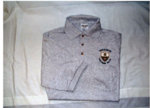
Grey Polo shirt with pocket. $28.00 ea. sizes small to XL $30.00 ea. sizes 2XL and 3XL Special colors add $3.00