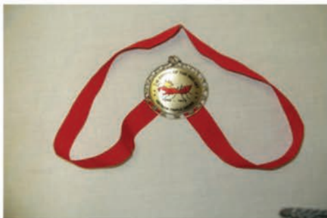
Lightweight ORA , 25% lighter than the Traditional Medal. $3.00 + $3.00 shipping. Frame your Traditional ORA Medal with your Certificate. You must have been awarded the ORA to be eligible to purchase this item