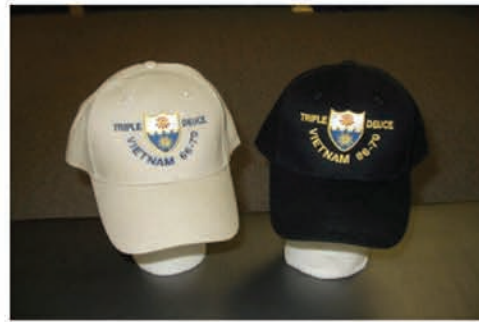
Six Panel Hat , $18.00 Available in khaki and black