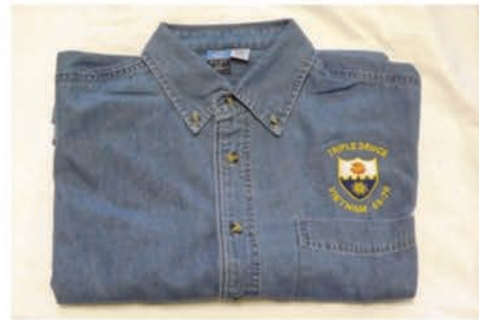
Dark denim long sleeve shirt with pocket. $35.00 sizes small to XL $37.00 sizes 2XL and 3XL Special colors add $5.00