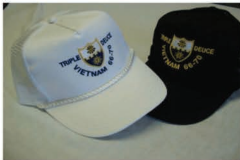
Summer Hat $18.00. Available in white, khaki and black. Five panel hat One size fits all