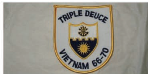
VN 2/22nd Patch $5.00 ea + $3.00 shipping