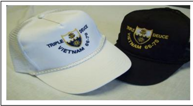
Summer hats, mesh back. White or Black