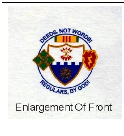
Enlargement Of Front