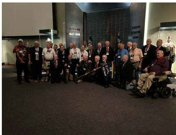
Viet Nam vets at Banquet