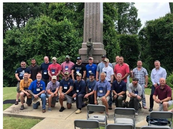
Iraq/Afghan Vets at 22 nd IR Monument