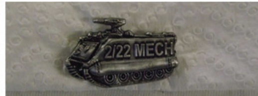
Triple Deuce Track Pin $5.00 + $3.00 shipping