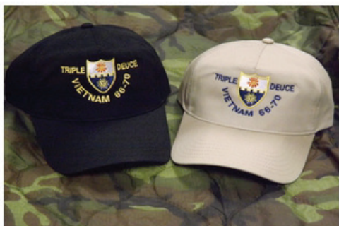
Five panel hat , $18.00 Available in khaki and black.