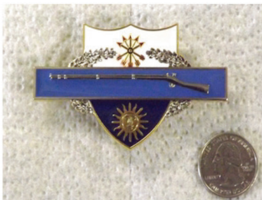
22nd CIB/DUI pin. $12.00 + $3.00 shipping