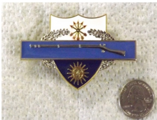
22nd CIB/DUI pin. $12.00 + $3.00 shipping