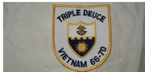
VN 2/22nd Patch $5.00 ea + $3.00 shipping