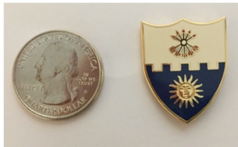
22nd Infantry Crest Pin. $7.00 + $3.00 shipping

1 Coin $ 10 Ea. shipping included 5 Coins $9 ea. + $3.00 shipping 10 Coins $ 8 ea. + $4.00 shipping 15 Coins $ 7 ea. + $7.00 shipping 20 Coins $ 5 ea. + $7.00 shipping