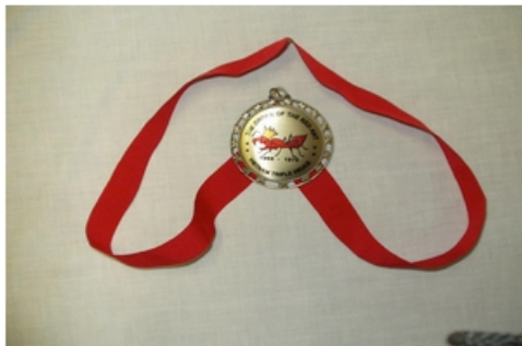
Lightweight ORA , 25% lighter than the Traditional Medal. $3.00 + $3.00 shipping. Frame your Traditional ORA Medal with your Certificate. You must have been awarded the ORA to be eligible to purchase this item