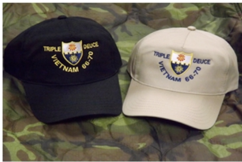
Five panel hat , $18.00 Available in khaki and black.