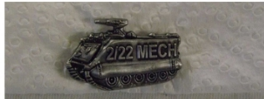
Triple Deuce Track Pin $5.00 + $3.00 shipping