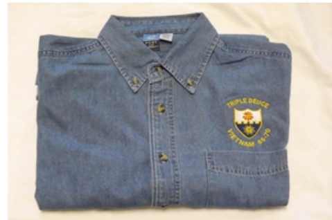
Dark denim long sleeve shirt with pocket. $35.00 sizes small to XL $37.00 sizes 2XL and 3XL Special colors add $5.00