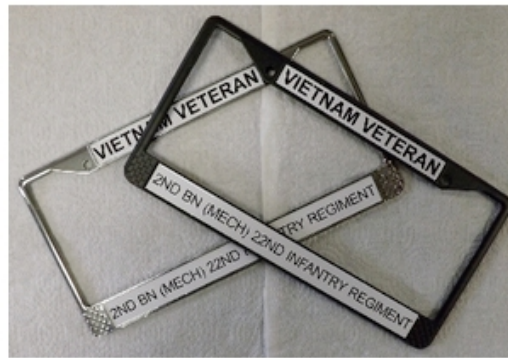
Triple Deuce License Plate Frame (black or Chrome) $12.00 Each Shipping $8.00 for up to two frames