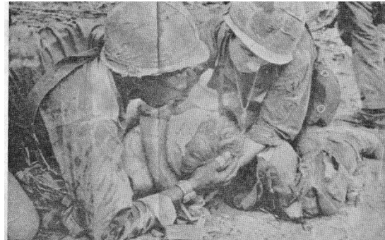
MEDICS CRADLE HEAD OF A WOUNDED 25TH DIV. TROOPER IN FIGHTING NORTHWEST OF SAIGON.