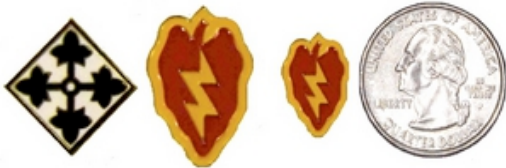
Small Division Pins. $5.00 each + $3.00 shipping Large 25th Infantry. $7.00 each + $3.00 shipping