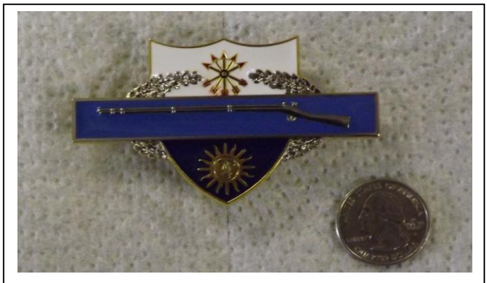
The CIB/DUI $12.00 + $3.00 shipping. As with other pins there is no shipping charge if ordered with a shirt or hat.