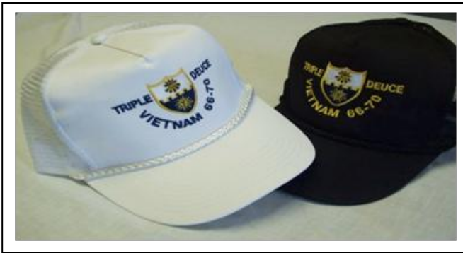
Summer hats, mesh back. White or Black