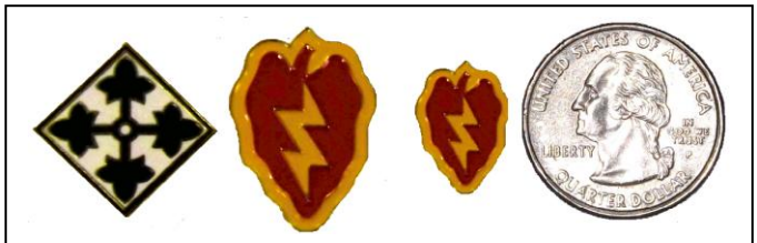
The 4 th ID and Small 25 th ID pins are $5.00 and the Large 25 th ID pin is $7.00 Shipping is $3.00