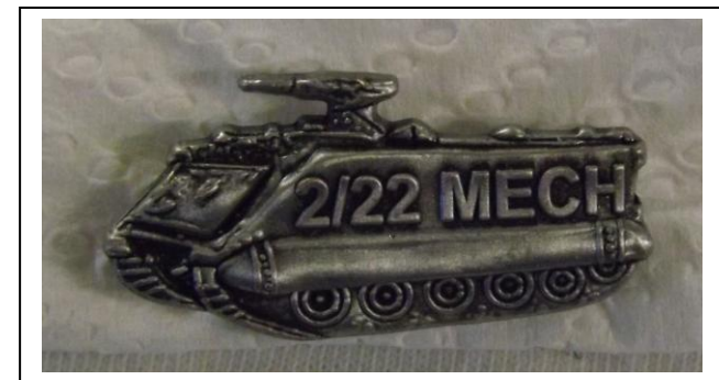
MECH Pin is $5.00 Shipping is $3.00