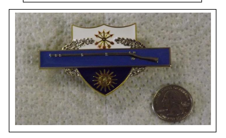
The CIB/DUI sells for $12.00 + $3.00 shipping. As with other pins there is no shipping charge if ordered with a shirt or hat.