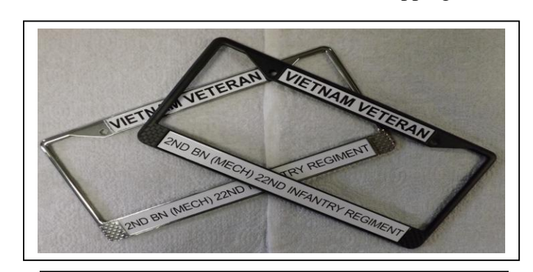
Triple Deuce License Plate Frames are now available in chrome or black. $12.00 each Shipping $8.00 up to two frames

Include your name, address, phone number and email address. If I'm out of something I'll let you know when to expect it. If you'd like something special, let me know. The guy who does the embroidery is an Air Force Vet and has great respect for you Infantrymen. If there is a way to put the logo on something he'll do it. Call me at 207-634-3355 or email to <a href="mailto:ilmay@tds.net">ilmay@tds.net</a>