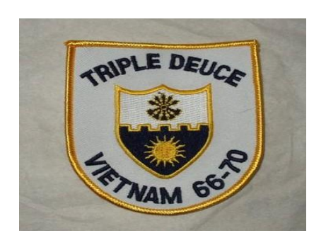
VN 222 Patch. $5.00 ea + $2.00 for shipping

1 Coin $10.00 ea. shipping included 5 Coins $ 9.00 ea. + $3.00 shipping 10 Coins $ 8.00 ea. + $4.00 shipping 15 Coins $ 7.00 ea. + $7.00 shipping 20 Coins $ 5.00 ea. + $7.00 shipping