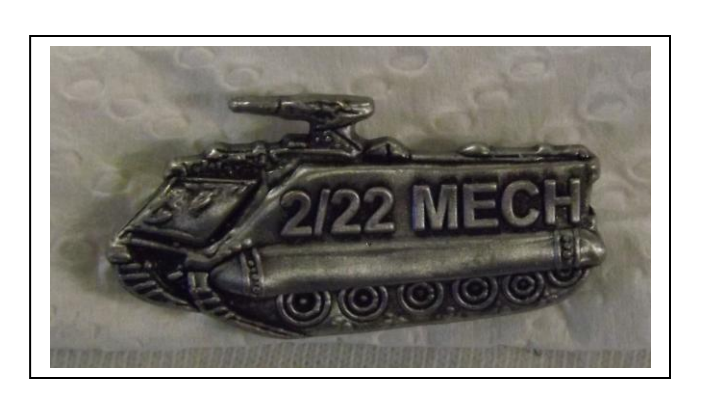
MECH Pin is $5.00 Shipping is $3.00