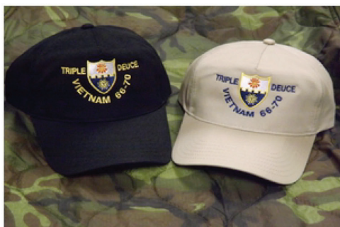
Five panel hat , $19.00 Available in khaki and black.