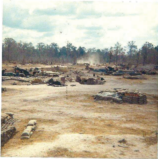
1168 FSB BURT

day the same Huey helicopter that had dropped us off came back to pick up the three of us and took us back to Camp Ranier, Dau Tieng.