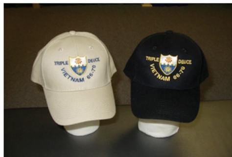
Six Panel Hat , $19.00 Available in khaki and black