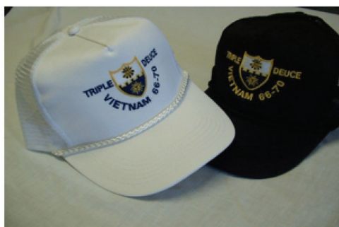
Summer Hat $19.00. Available in white and black. Five panel hat One size fits all