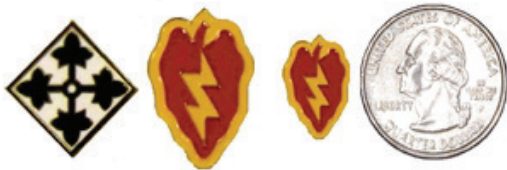
Small Division Pins. $5.00 each + $3.00 shipping Large 25th Infantry. $7.00 each + $3.00 shipping