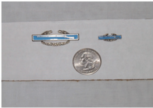
Midi CIB. $7.00 + $3.00 Shipping Mini CIB. $5.00 + $3.00 Shipping