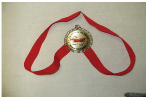
Lightweight ORA , 25% lighter than the Traditional Medal. $3.00 + $3.00 shipping. Frame your Traditional ORA Medal with your Certificate. You must have been awarded the ORA to be eligible to purchase this item

$35.00 sizes small to XL $37.00 sizes 2XL and 3XL Special colors add $5.00