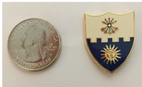
22nd Infantry Crest Pin. $7.00 + $3.00 shipping

1 Coin $ 10 Ea. shipping included 5 Coins $9 ea. + $3.00 shipping 10 Coins $ 8 ea. + $4.00 shipping 15 Coins $ 7 ea. + $7.00 shipping 20 Coins $ 5 ea. + $7.00 shipping