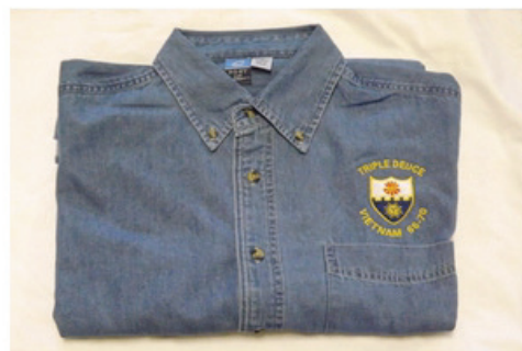
Dark denim long sleeve shirt with pocket.

$35.00 sizes small to XL $37.00 sizes 2XL and 3XL Special colors add $5.00