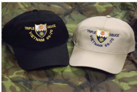
Five panel hat , $18.00 Available in khaki and black.