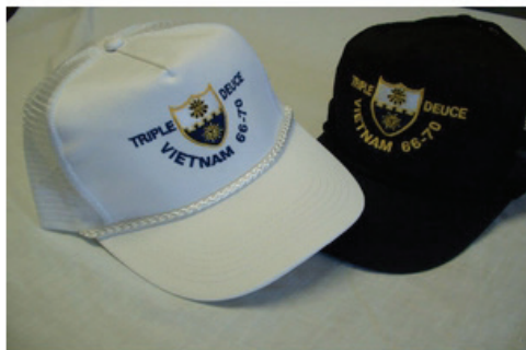
Summer Hat $18.00. Available in white and black. Five panel hat One size fits all