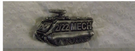
Triple Deuce Track Pin $5.00 + $3.00 shipping