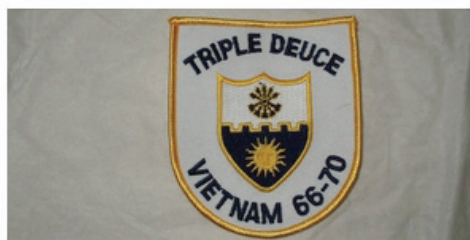
VN 2/22nd Patch $5.00 ea + $3.00 shipping