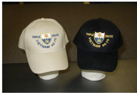
Six Panel Hat , $18.00 Available in khaki and black