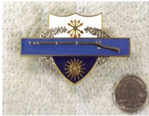
22nd CIB/DUI pin. $12.00 + $3.00 shipping