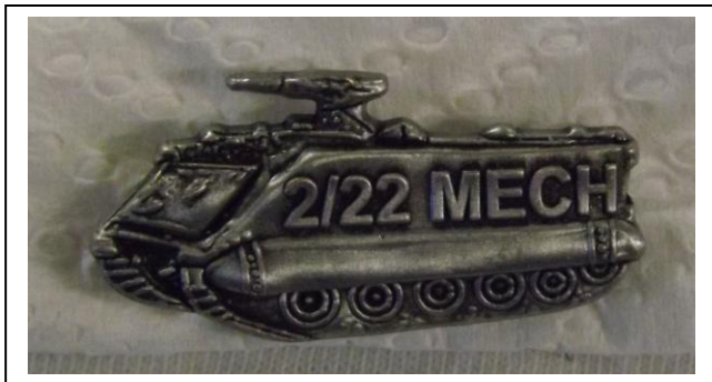
Pins are $5.00 ea + Shipping